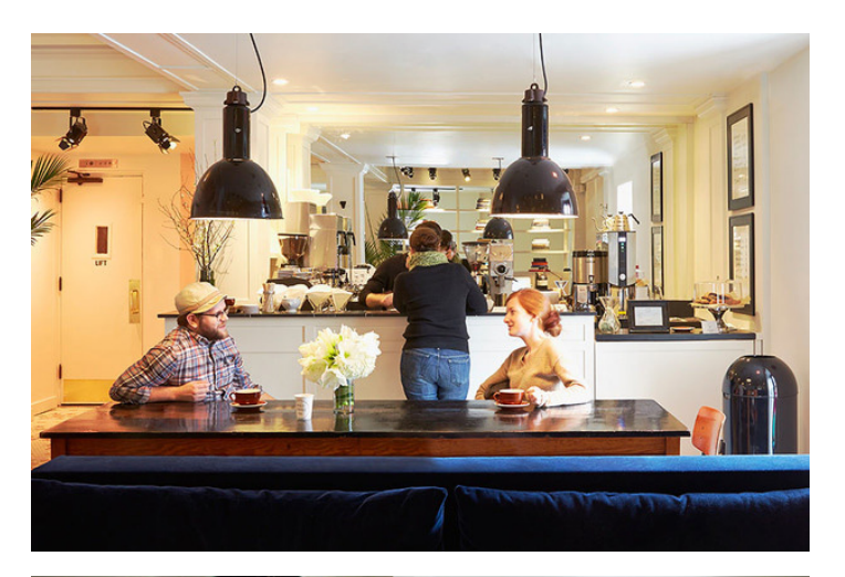
Image of coffee bar courtesy of The Dean Hotel, all other photos by Nara Shin

Visit The Dean Hotel's website to book a reservation and learn more. Single bunk rooms start at $79.